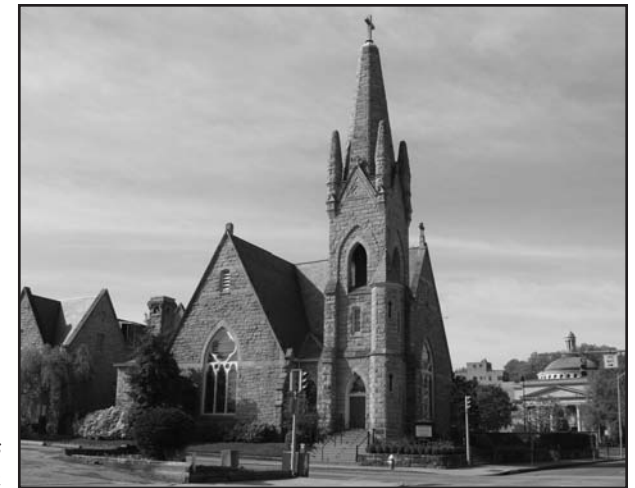
St. John's Episcopal Church

History: About 1827 interest in creating Kanawha Valley's first Episcopal church began. The original Saint John's Episcopal Church, a brick building on the northwest corner of Virginia and MacFarland Sts., was built and consecrated in 1839. After its use by the Union Army during the Civil War, the building was repaired and refurbished. In 1888, the congregation moved into its present structure. The adjacent parish house was completed in 1928. The buildings have been placed on the National Register of Historic Places.