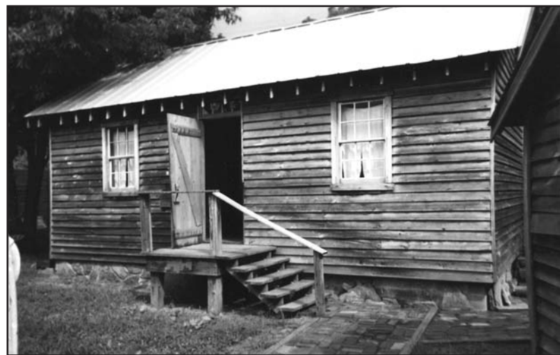
Booker T. Washington's Childhood Cabin (See pg. 10)

Directions: Located on Midland Trail (US Rt. 60) in Malden, West Virginia, across from Cabin Creek Quilts