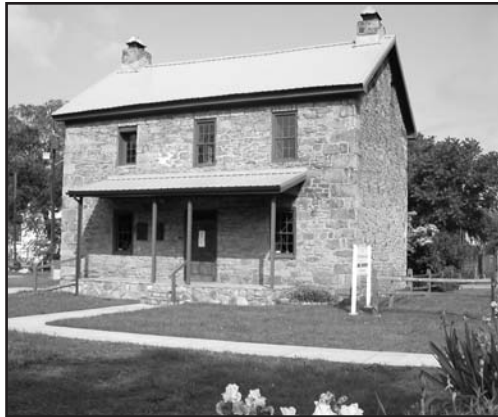
Samuel Shrewsbury Old Stone House