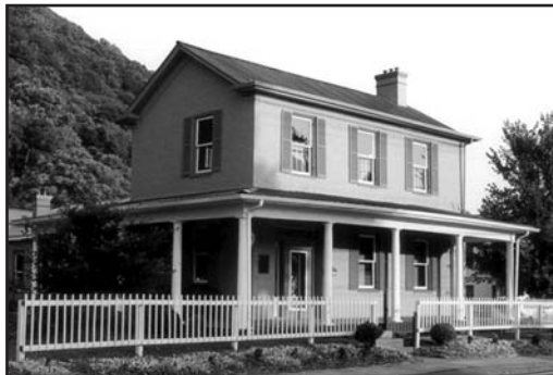
Cabin Creek Quilts Historic Hale House