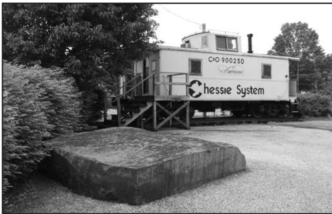
Hurricane Petroglyph & Caboose Museum

Special Events: Banjo and Bluegrass Festival in October, Civil War Reenactment weekend in March, over 300 reenactors commemorate the skirmish at Hurricane Bridge and the Battle of Scary Creek. Mary Ingles Trail reenactment (see page 45), and the Holiday and Historic Home Tours