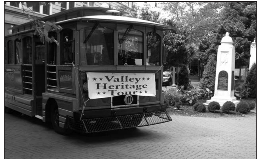
Valley Heritage Tour

Special Events: Valley Heritage Tour and African-American / Jewish Dialogue Group