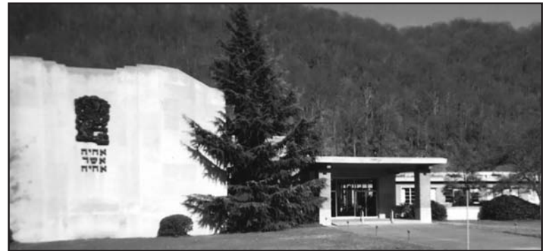
Temple Israel-Congregation B'nai Israel

History: Congregation B'nai Israel (Temple Israel) was informally organized in 1856, some seven years before the creation of the State of West Virginia. The Congregation's cemetery was founded even earlier, in 1836, and is the oldest Jewish cemetery in West Virginia. In 1875, the Congregation moved to a small Temple on Lee Street. The Virginia Street Temple was erected and dedicated in 1894. After housing 66 years of worship, the Virginia Street Temple was replaced in 1960 with the completion of our current home on Kanawha Boulevard at Chesapeake Avenue.