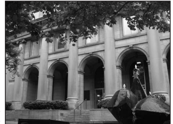
Kanawha County Public Library