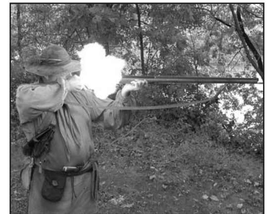
A primitive shooter is taking aim

Board Meets: As needed Membership Fee: $35 Membership Meets: Regular matches on the second Saturday of the month; Primitive matches are on the first Saturday of the month Programs: Upon request