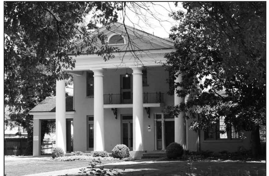
MacFarland-Hubbard House (See pg. 80)